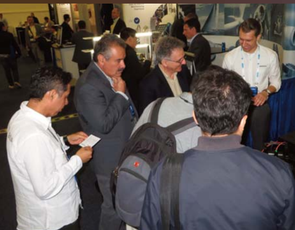
EXHIBIT AT ICMCTF International Conference on Metallurgical Coatings & Thin Films

Sponsored by the AVS Advanced Surface Engineering Division • http://www2.avs.org/conferences/icmctf/