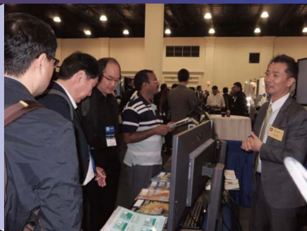
Exhibit Dates: April 28 & 29, 2020

Conference Dates: April 26 - May 1, 2020 • Town and Country Hotel & Convention Center, San Diego, California